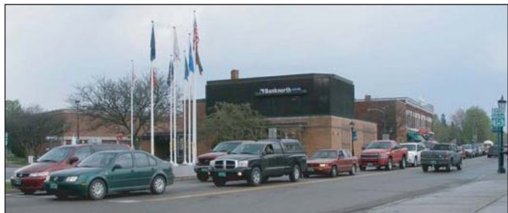
Photo 1: PM Traffic at the VT 15 and Five Corners Intersection (Level of Service F)

The Transportation Technical Report (Appendix O) indicates that LOS F conditions, i.e., substandard traffic flow conditions indicative of operational deficiencies, currently occur during the AM and/or PM peak hour at four of the 14 intersections on VT 2A between I-89 Exit 12 in Williston and Five Corners in Essex Junction., a distance of 3.5 miles.