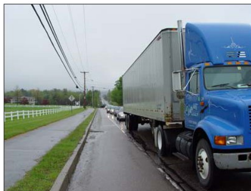
Photo 2: PM Traffic on VT 2A About 1/2 Mile South of Mountain View Road (Level of Service F)

Truck traffic represents a relatively high percentage of overall traffic on Project Area roadways. Trucks represent between five and six percent of overall annual average daily traffic on VT 2A (which is part of the Vermont Truck Network) between Mountain View Road in Williston and Five Corners in Essex Junction, a predominately a residential area. These percentages approximate those of I-89 in Chittenden County, on which trucks represent between five and nine percent of average annual daily traffic. Truck traffic in the Project Area is a concern due to its adverse effects on the suburban and rural character of the Project Area, and due to safety and environmental concerns raised with heavy truck movements on roads that may have inadequate design features to accommodate such movements.